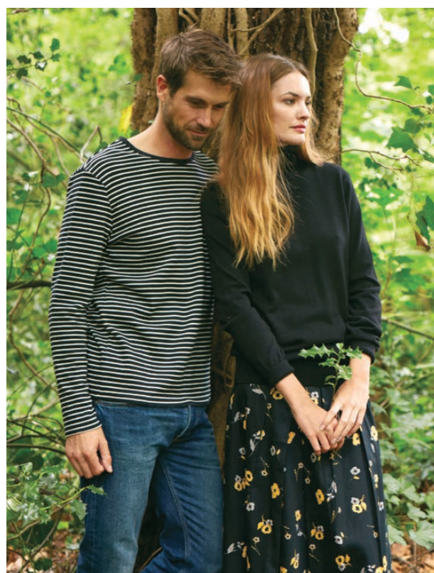
People Tree (2015)

The dataset used in the PUMA study was relatively small, and focused on just one cotton producing region in India. In order to further fill the gaps in evidence, in 2014 a comprehensive Life Cycle Assessment (LCA) was published by the Textile Exchange, representing global organic cotton production. 48 The performance of organic cotton was measured against the findings of an in-depth, peer-reviewed LCA of conventional cotton, published by Cotton Incorporated in 2012. 49