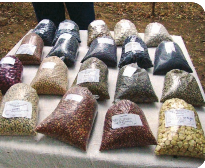
ORGANIC COTTON ROTATION CROPS PACKAGED FOR SALE, ZAMBIA.

Contrary to common belief, organic cotton production is economically competitive with its conventional counterpart. A long term study in India recently revealed that, despite lower average yields, net profits of organic cotton systems are in fact similar, or sometimes better, than those of conventional systems due to the significantly reduced input costs 6 .