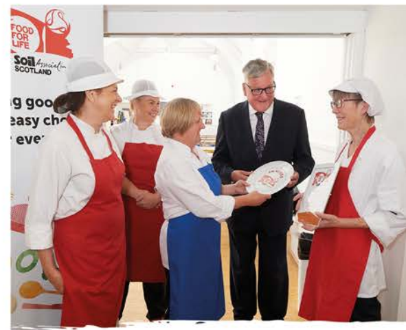
Fergus Ewing, Cabinet Secretary for the Rural Economy, presented the award to catering staff at Central Primary School, Inverness.