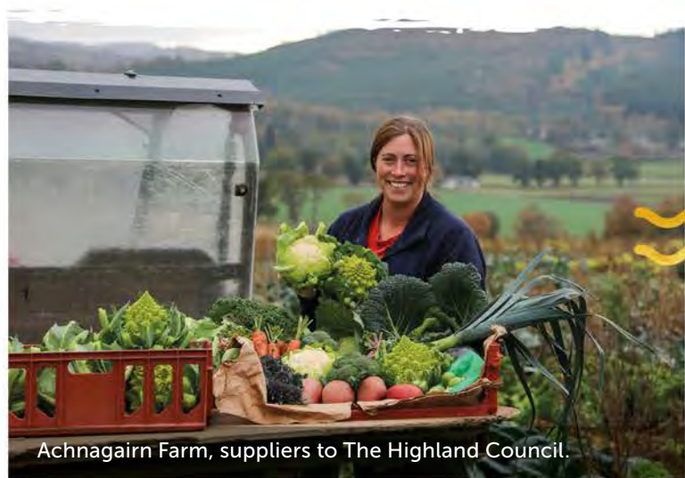
Achnagairn Farm, suppliers to The Highland Council.

In an average year, Scotland's public sector spends almost £150 million on food and drink. Over a third of local authority money spent on Scotland Excel frameworks is now spent on food that has been produced or manufactured in Scotland – a figure that has grown by more than half since 2015.