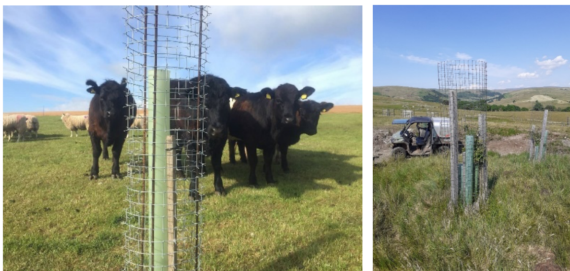
Newly planted silvopasture trees in Cactus Guards.

To increase the presence of scattered native trees within the farmed landscape.