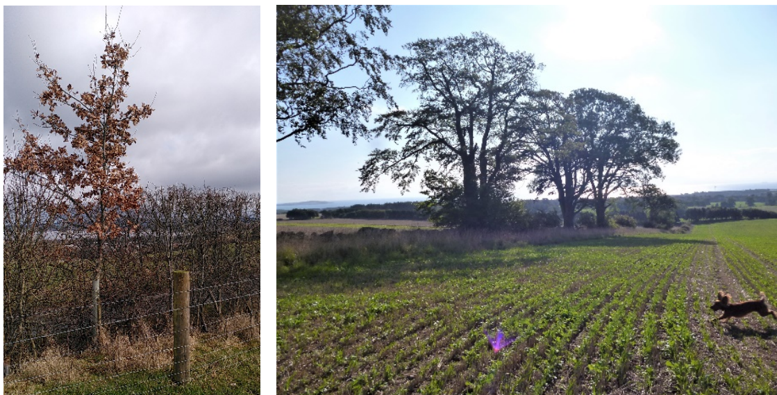
Examples of planted hedgerow tree (left) and field boundary trees (right).

To increase the diversity of habitats in hedgerows and to restore tree lines along field boundaries.