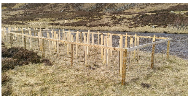
Examples of silvopasture tree enclosures.