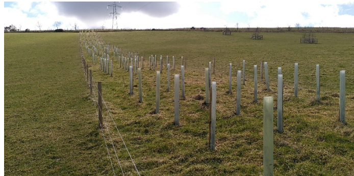
Examples of potential small scale woodland options.